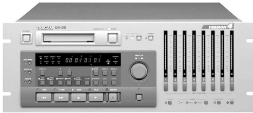
TASCAM's DA-88, the original DTRS format recorder

The DA-88 was originally intended for the music market, but since it was so full featured, it also found its way into